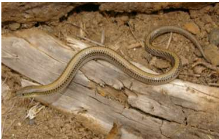
Copyright © 2016 Ian Smales (Biosis Pty. Ltd.)

The Striped Legless Lizard is a nationally threatened species. It is listed as vulnerable under the Environment Protection and Biodiversity Conservation Act 1999 and as endangered in Victoria under the Department of Environment, Land, Water and Planning (DELWP) Advisory list of threatened vertebrate fauna. The species is also listed as threatened under the Victorian Flora and Fauna Guarantee Act 1988 .