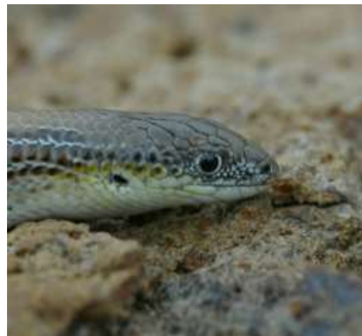
Copyright © 2016 Ian Smales (Biosis Pty. Ltd.)